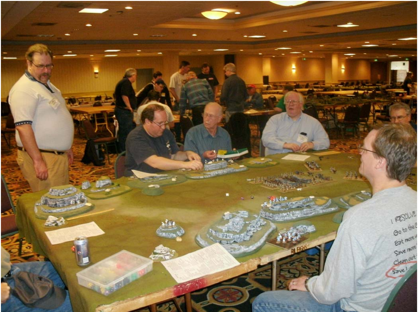
A colonial game Thursday in an almost empty DISTLEFINK

COLDWARS 2010 got off to a bit of a slow start. This may have been partly out of habit, since normally COLDWARS is a 3 day show. But HMGS owed the HOST a three day and a four day show after moving HISTORICON. Also the winter had been strange. A number of people, including Manny Granillo who was to run my SCW scenario with PANZERKORPS rules on Thursday afternoon, registered but were unable to attend.