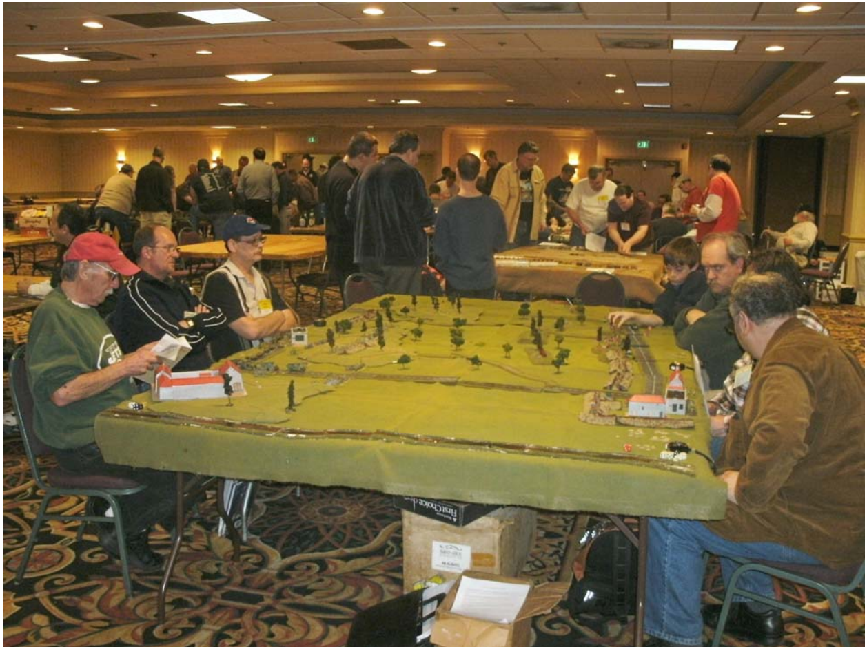
By evening when I ran my game attendance had picked up a bit.