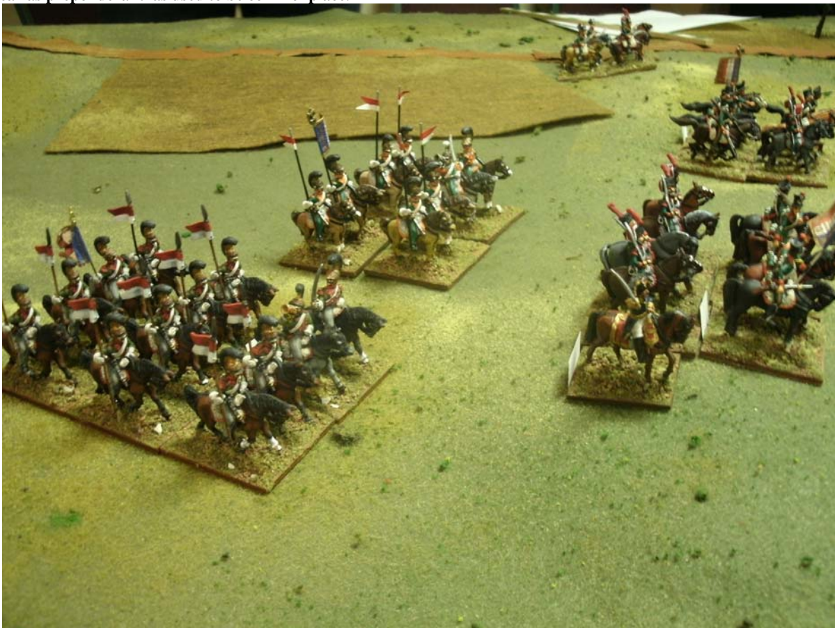
French Cavalry in a Theme Game

The theme was Napoleon's Enemies. There were perhaps a few more Napoleonic games including the Russian battle shown above. But nowhere near as preponderant as used to be commonplace.