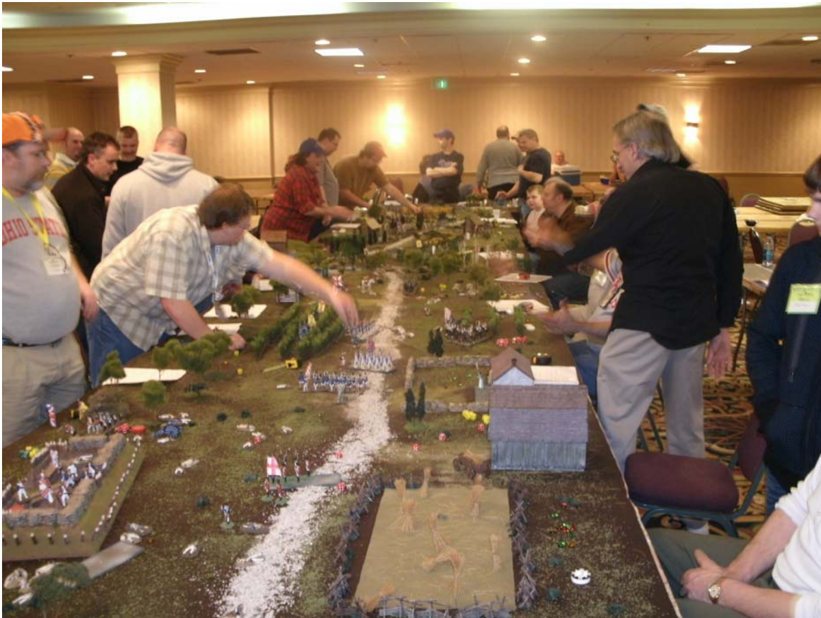
The Large of it-Ken Cliffe Staged a Massive 54mm AWI Epic