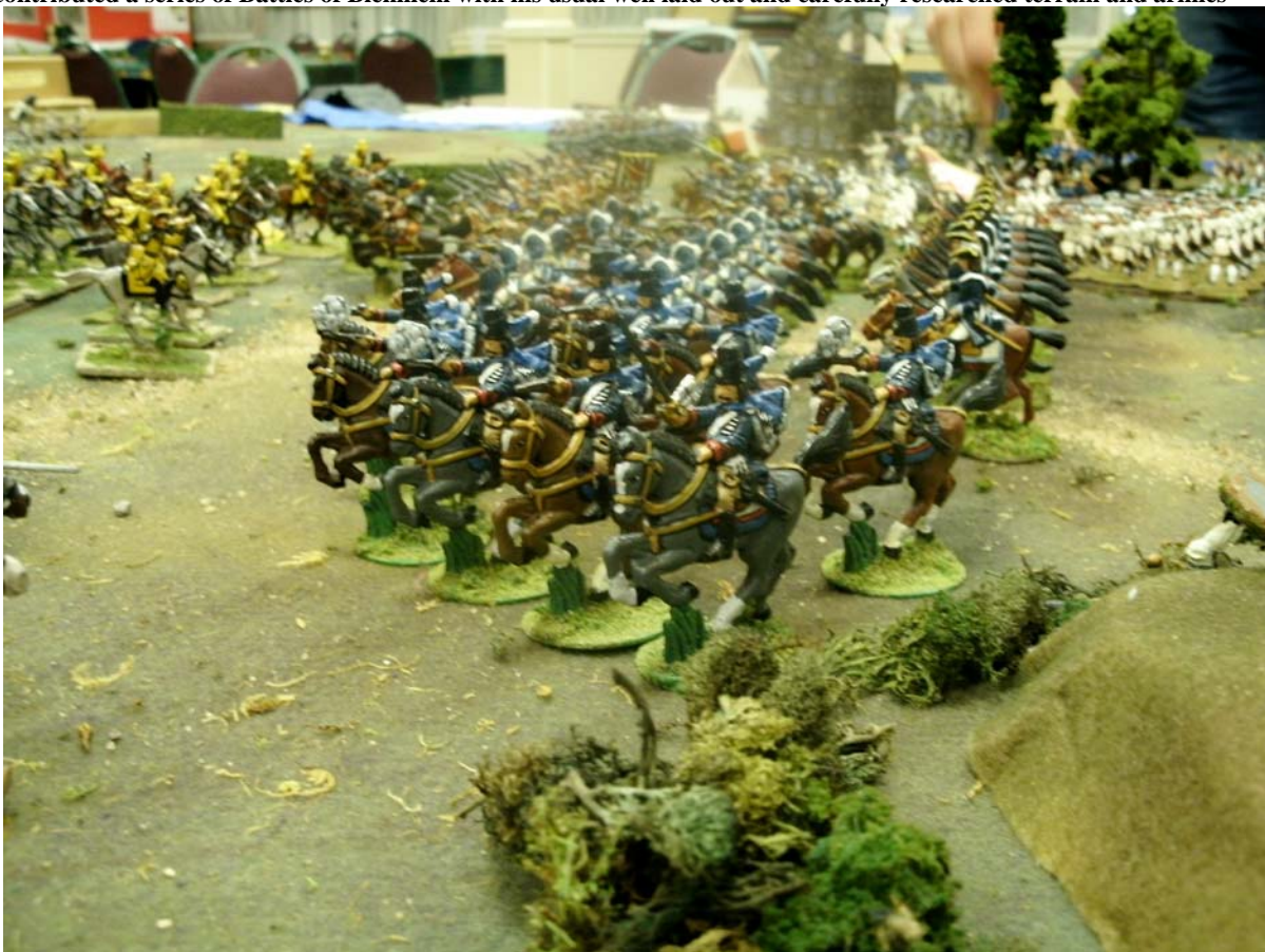
As a one time flats wargamers the HAWKS 40mm half rounds fascinate me.