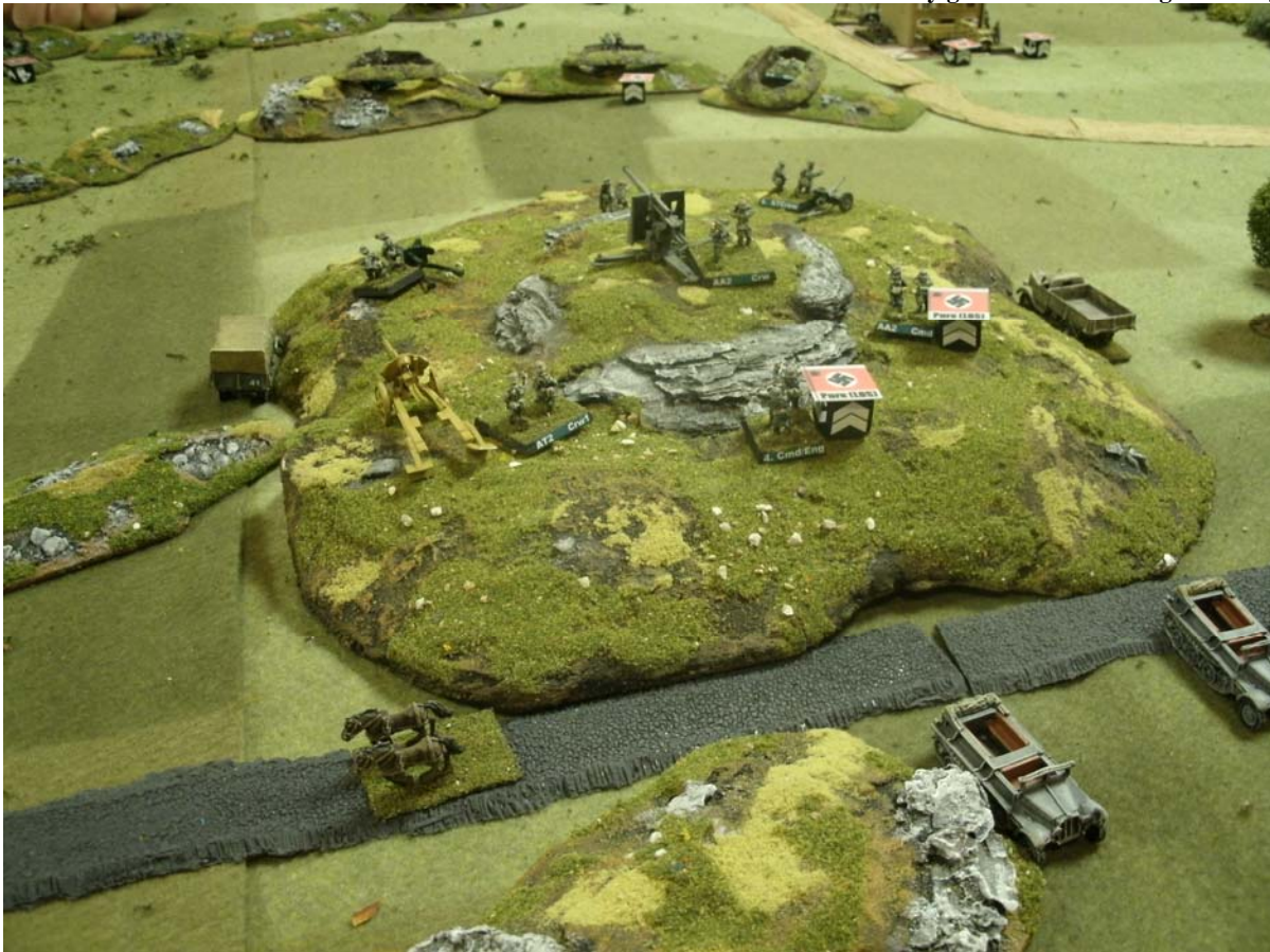
German Strong Point in France